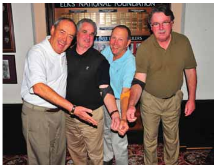
Three SECOND-place finishers, and the tournament organizer, at the last golf tourney get their swings fixed, as evidenced by their 'bandages.'