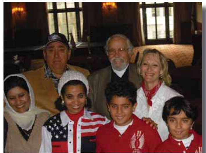
Veteran's Dream Team