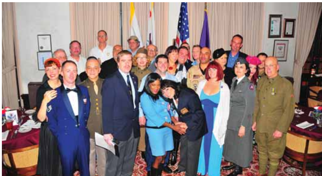
Evening Vets, Volunteers, and Officers