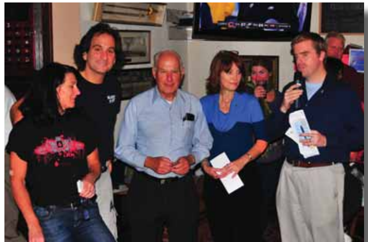
Drawing volunteers and winners