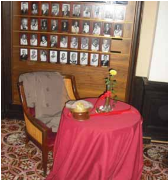
MIA-POW Table of Remembrance