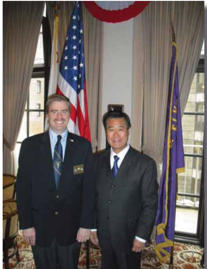
Senator Leeland Yee with the ER