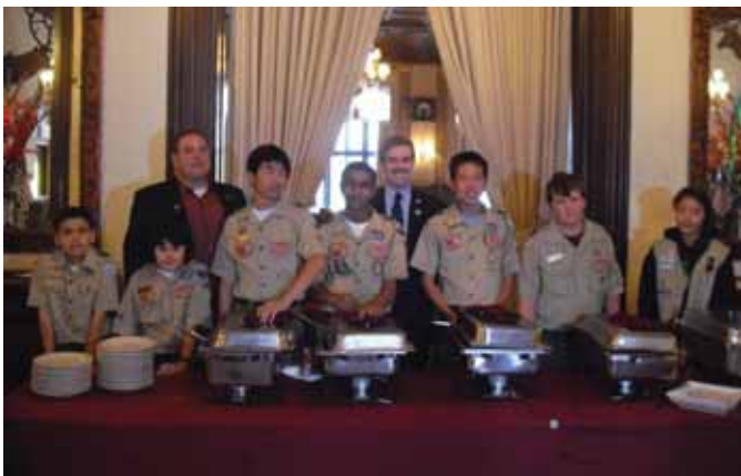
Boy Scouts prepared to serve lunch