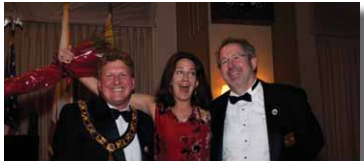
Yes. It's nice to be done.